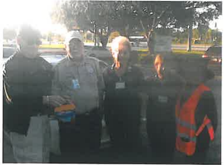
Pumpkin Patrolers left to right..